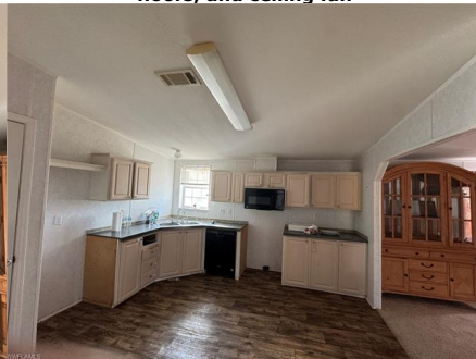
Kitchen with dark wood-type flooring, black appliances, vaulted ceiling, and sink

Video and/or audio surveillance with recording capability may be in use on these premises. Conversations should not be considered private.