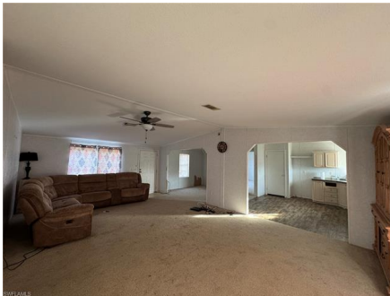
Unfurnished living room with light colored carpet, ceiling fan, and lofted ceiling