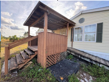
View of deck