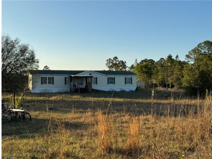
View of front of home