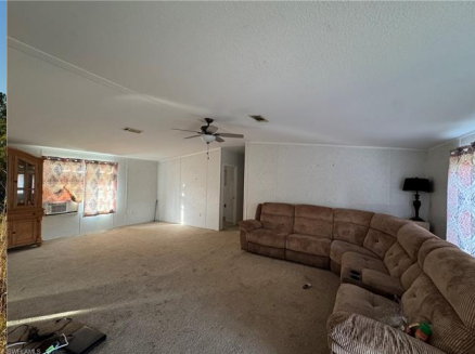
Living room featuring a textured ceiling, carpet floors, and ceiling fan