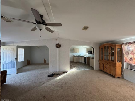
Unfurnished living room with light colored carpet, ceiling fan, and lofted ceiling