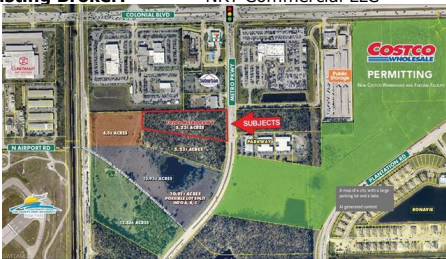
Map / location